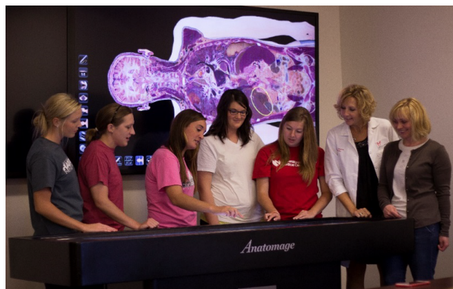
Figure 1: A student-centered learning environment. Diagnostic Medical Sonography students using the Anatomage Table Virtual Dissection table under the guidance of faculty to review relational anatomy. Virtual cadaver is displayed on the screen behind students.